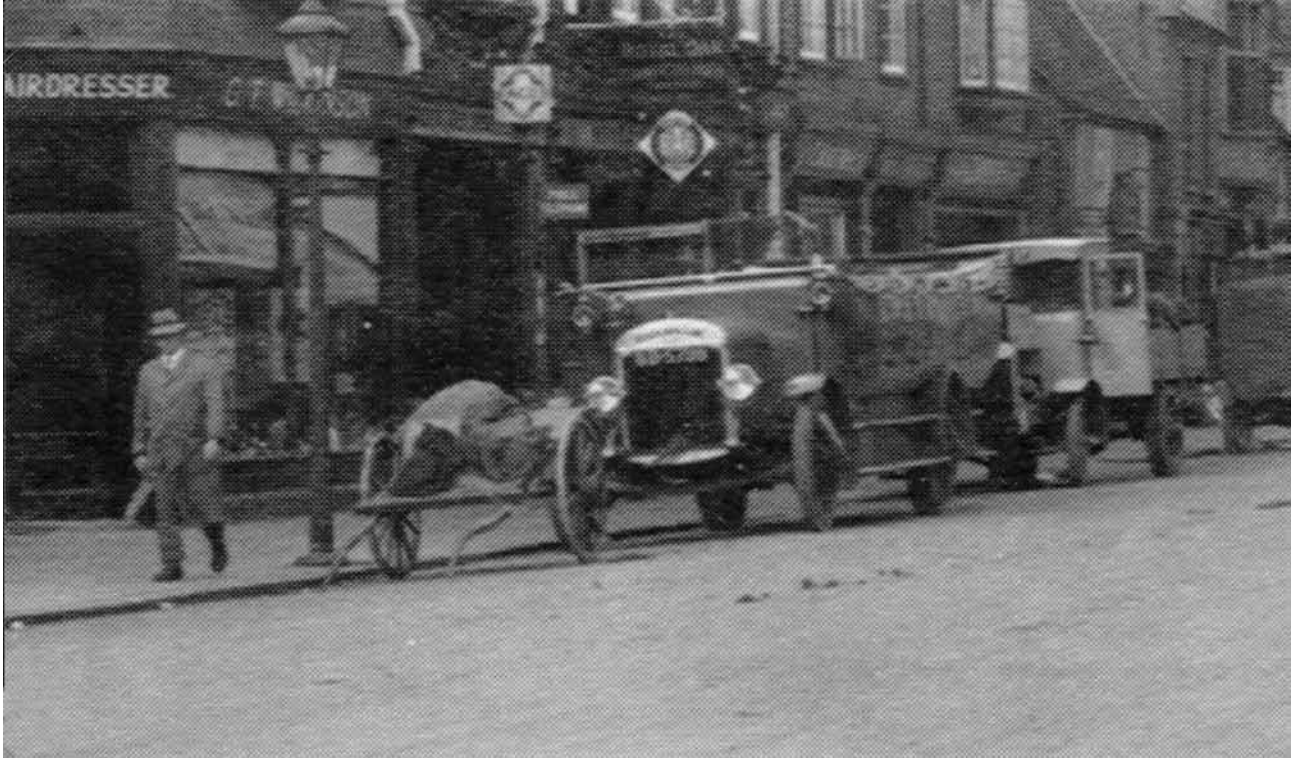
BD 5798 was a Thornycroft X-type of 1921 vintage and it was photographed at St. Neots in the early 1920s.