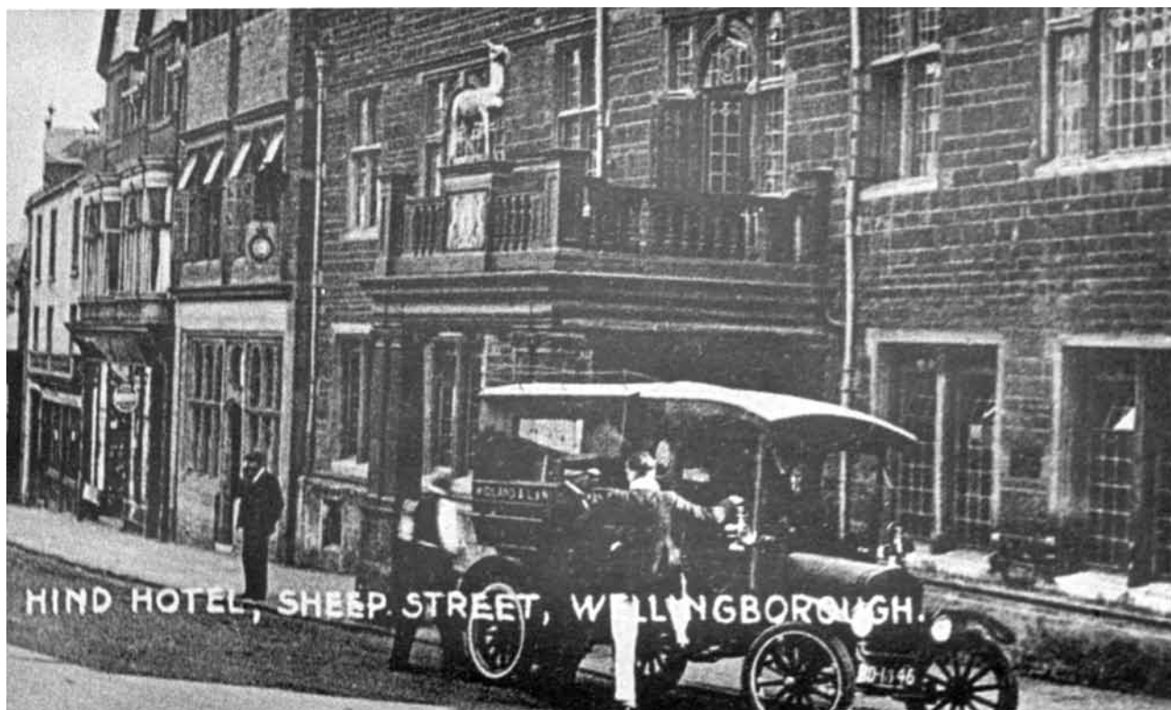
The green and white Ford T - BD 1846 - at the Hind Hotel, Wellingborough